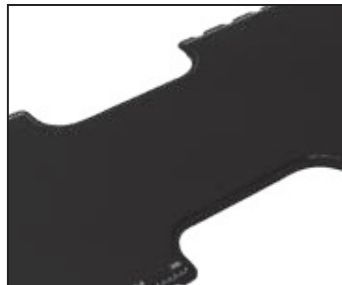
Central Cut-Out for Unobstructed Treatments paths including Non-Coplaner Fields.