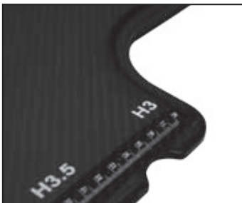
Laser Alignment Scales with indexing every 70 mm

Aluminum Equivalence: ~0.6 mm @ 100kVp Water Equivalence: 6 mm @ 6 MV Weight Limit: 249 kg (550 lb) Uniformly Distributed Load