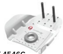
RT-4546C ArmShuttle™ Elite

Vac-Q-Fix Thigh Compression Cushions are securely held in place by non-metallic clips.