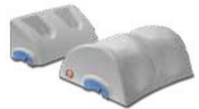
RT-4489KW & RT-4489FB SofTouch™ Knee Wedge & Foot Block