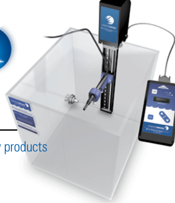
1D Water Scanning System

Model A10 EXRADIN Markus-type Parallel Plate Chamber collecting volume — 0.051 cc