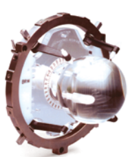
Varian Radionics™ CRW/BRW

Frame specific interfaces are available for all SRS systems